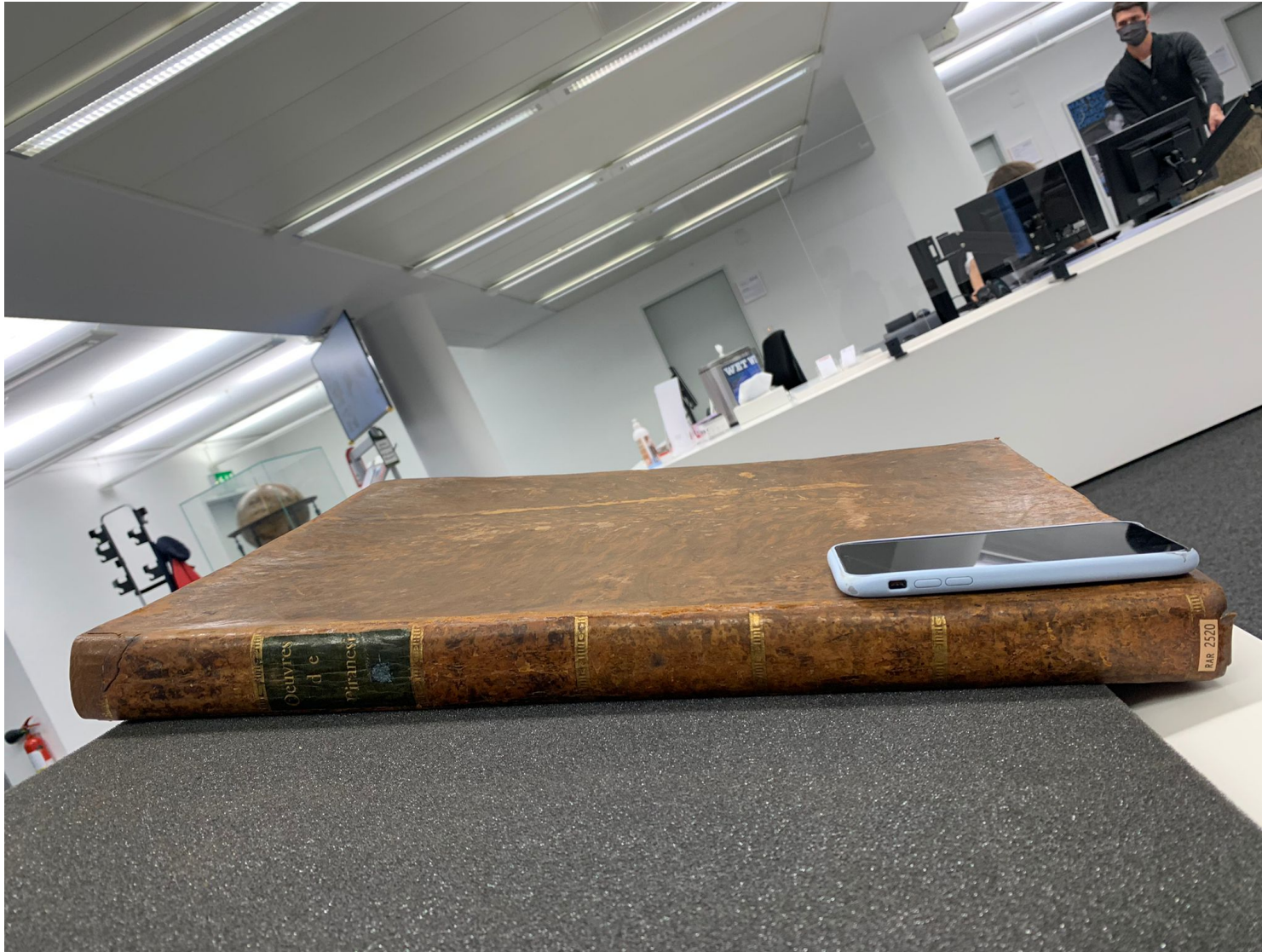
The book has the format A3 and the cover is made out of Leather. For size reference we placed an Iphone on top of it.